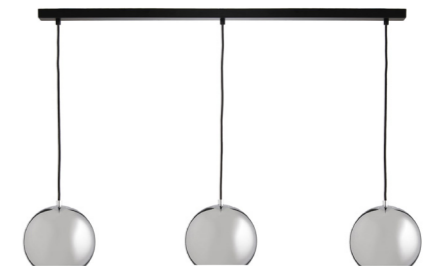
Glossy chrome: art.no. 100323

Instagram ready images. The correct format for Instagram images can be downloaded here .